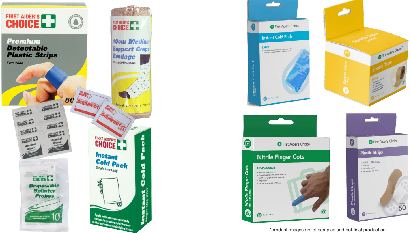
*product images are of samples and not final production