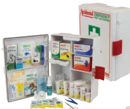
101461 W360 x H470 x D185mm

Our National Workplace First Aid Kits are suitable for a wide variety of industries. This range makes First Aid compliance easier for your workplace, simply choose the kit style that best suits your workplace needs - ABS Wall Mountable and Poly Portable.