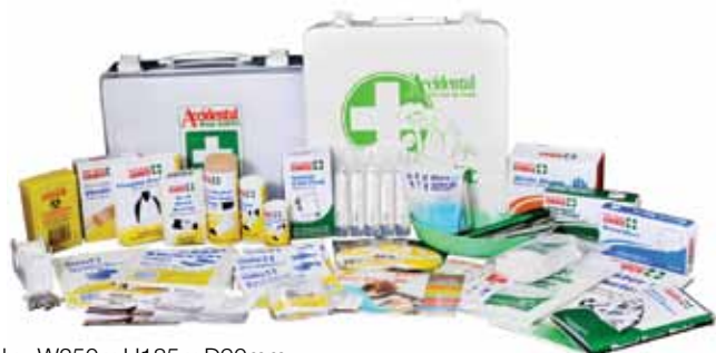
Poly: W250 x H185 x D90mm

All workplaces are required by law to have first aid facilities, including tradies vehicles and mobile plant. Our Tradies Kit makes first aid convenient and accessible on the job. Both kits have a slim design ideal for stowing in work vehicle cabins and behind seats. The durable poly kit comes complete with wall mount brackets.