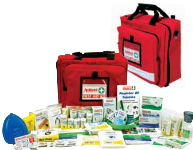
101464 W355 x H355 x H200mm