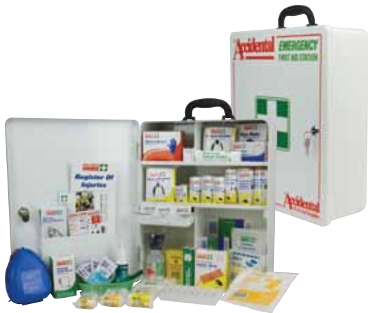
101462 W350 x H450 x D150mm

Our National Workplace First Aid Kits are suitable for a wide variety of industries. This range makes First Aid compliance easier for your workplace, simply choose the kit style that best suits your workplace needs - Metal Wall Mountable, ABS Wall Mountable, Soft Pack Portable and Poly Portable.