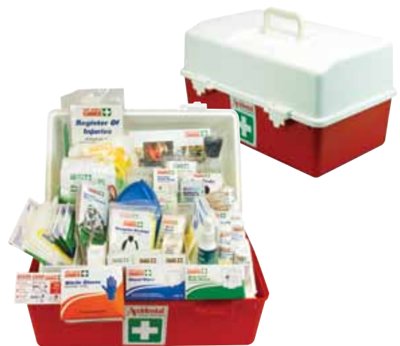
101468 W475 x H260 x D255mm