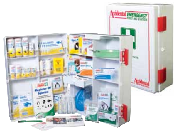
101466 W360x H470 x D185mm