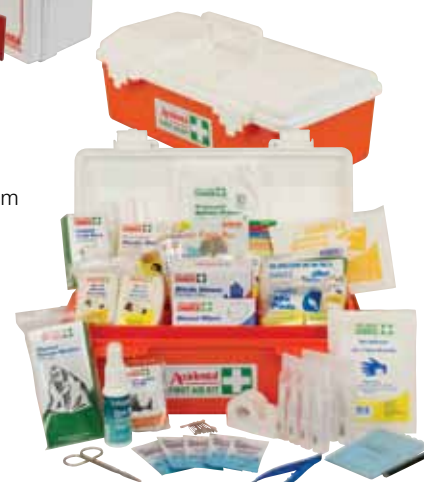
101463 W400 x H140 x D200mm