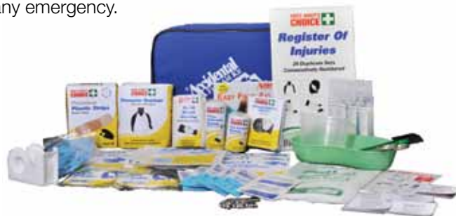
W265 x H200 x D75mm

Features durable 600D/PVC fabric construction. Includes quality first aid products and is a perfect first aid kit when you need a comprehensive range of products on hand for any emergency.