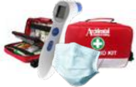
FIRST AID KITS & SUPPLIES