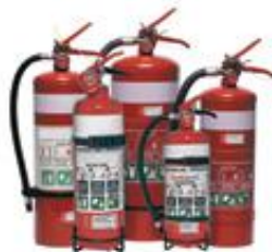
FIRE SAFETY EQUIPMENT