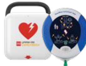
DEFIBRILLATION & RESCUE EQUIPMENT