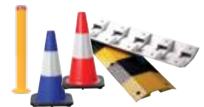
TRAFFIC & PARKING EQUIPMENT

Discover more of our range at www.accidental.com.au